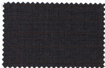
624 - 125 / 800 100% Wool 150cm 260g Charcoal / Tan