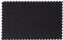
624 - 126 / 800 100% Wool 150cm 260g Graphite