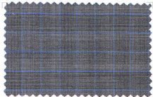
624 - 123 / 800 100% Wool 150cm 260g Light Grey / Blue